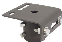
LF-AD-SF Slip Fitter Adapter