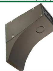
LF5-EXTARM Extension Arm Adapter